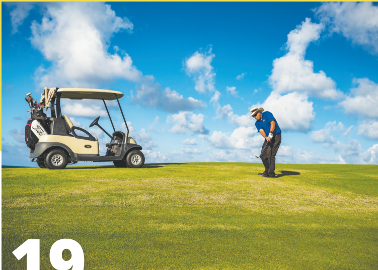
19 GOLF COURSE

Heritage mansion that constitutes the Club House of the golf course, with gourmet restaurant, gazebo bar and 8 rooms. Carretera Las Americas, Km 8 1/2 Varadero. Tel.: (+53) 45 66 7388