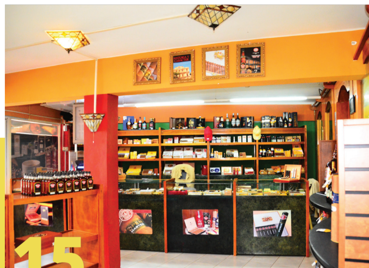
15 PLAZA HICACOS SHOPPING MALL

Ideal place for your events combined with gastronomic services and specialized stores. Open from 9:00 am to 9:00 pm. Las Americas Avenue Km 11 1/2. Varadero. Tel.: (+53) 45668181