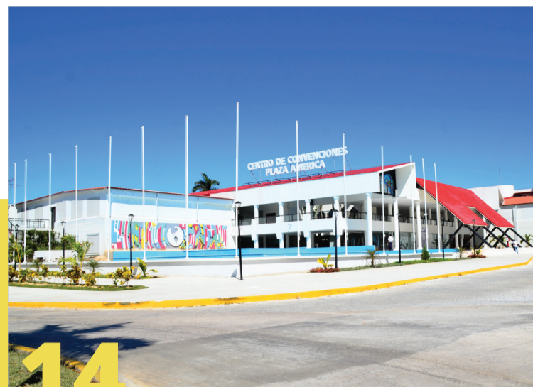
14 PLAZA AMERICA CONVENTION CENTER

It gathers all the services of the destination, specialized stores and varied gastronomic offer. Open from 10:30 a.m. to 10:00 p.m. 1st Avenue between 62nd and 64th Street. Varadero. Tel.: (+53) 45638211