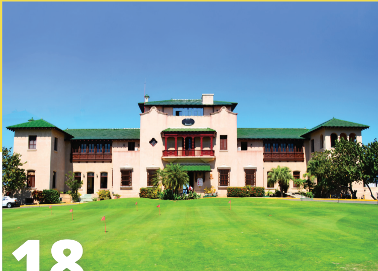
18 XANADU MANSION

Heritage mansion that constitutes the Club House of the golf course, with gourmet restaurant, gazebo bar and 8 rooms. Carretera Las Americas, Km 8 1/2 Varadero. Tel.: (+53) 45 66 7388