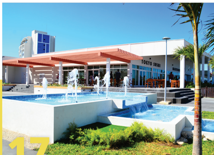
17 PLAZA OASIS

Tourist village with bowling alley, party room, restaurants, coffee house, stores and much more. Open from 7:00 am to 1:00 am. Autopista del Sur and Final, Punta Hicacos. Tel.: (+53) 45667330