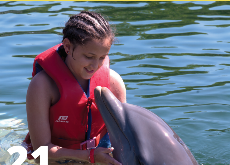
21 VARADERO DOLPHINARIUM

The most emblematic of Varadero's nights, live shows and musical groups. Open from 8 pm to 3 am. Ave Las Americas km 1. Varadero. Tel.: (+53) 45623132 (+53) 45623131