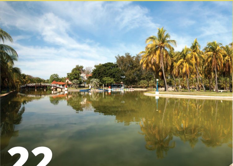
22 JOSONE PARK

A natural park with a variety of services for family enjoyment and the opportunity to swim with dolphins. Open from 9:00 am to 5:00 pm. Las Morlas Road, Km 11. Varadero. Tel.: (53) 45668031