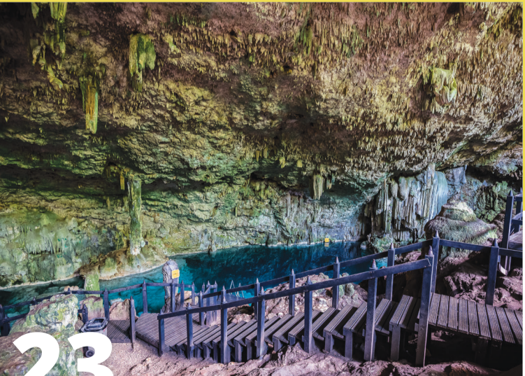
23 SATURNO CAVE

Green jewel in the historic center of the resort with a varied gastronomic offer and other services. Open from 9:00 am to 11:00 pm. 1st Avenue between 56 and 59. Varadero. Tel.: (+53) 45 667778