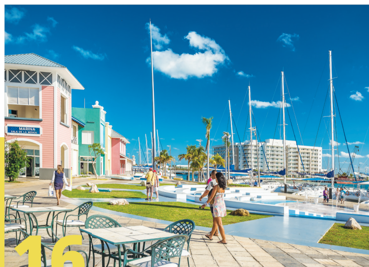
16 LAS MORLAS SQUARE

Variety of stores and specialized services with integrated offer for children: Leisure Club. Open from 9:00 am to 9:00 pm. Avenida 1era e/ 44 y 46, Varadero. Tel.: (+53) 45 61 4837.