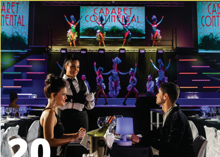
20 CONTINENTAL CABARET

The only 18-hole golf course in Cuba, with a heritage-valued clubhouse, the Xanadu Mansion. Open from 6:00 am to 7:00 pm. Carretera Las Americas, Km 8 1/2 Varadero. Tel.: (+53) 45 66 7388