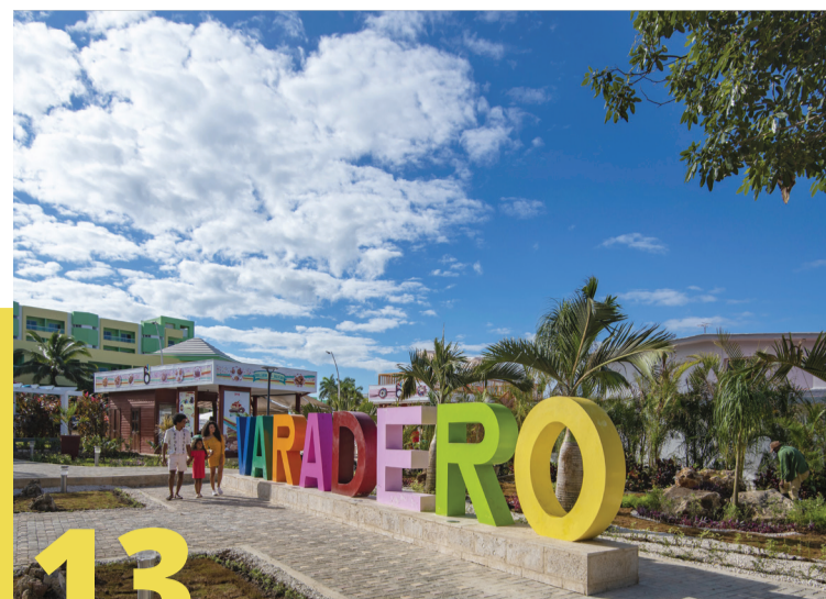
13 VARADERO BOULEVARD

It gathers all the services of the destination, specialized stores and varied gastronomic offer. Open from 10:30 a.m. to 10:00 p.m. 1st Avenue between 62nd and 64th Street. Varadero. Tel.: (+53) 45638211